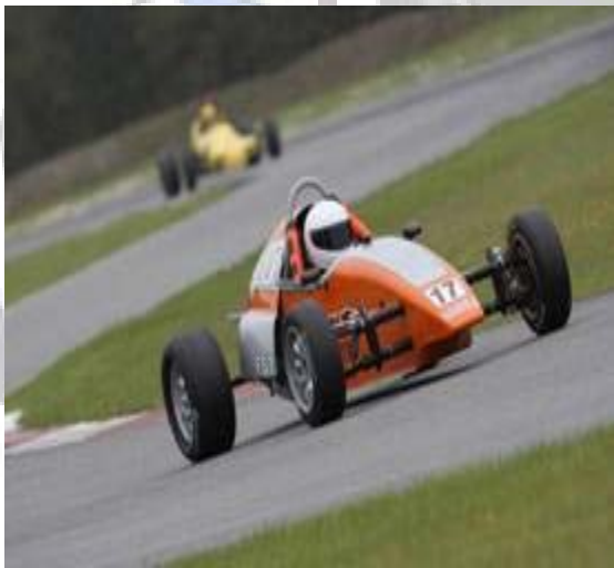
The Mysterian M5